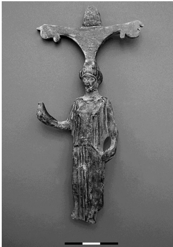
Fig. 2. Handle of a bronze mirror depicting a Caryatid.

earlier activity was also recovered, mixed into the Late Hellenistic find layer. The finest piece is the handle of a bronze mirror depicting a Caryatid in Doric chiton, holding the skirt with her right hand and a small bird in her left hand (Fig. 2). It finds its best parallel among the Caryatid mirrors of the Sikyon school that date to the 470s BC. 2 Fragments of Corinthian roof tiles belonging to an earlier building, including part of a painted sima, were also found. The sima dates to the sixth century BC, thereby giving a clearer date of this earlier building (a temple?).